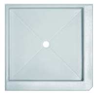
Base can be installed with entry on either side. Size: 48"x48"

Classic is not a word to be used lightly. A classic fits anywhere. A classic has lasting beauty. And it's the perfect choice to brighten up any bathroom. The Pittsburgh Corning Glass Block Classic Shower design brings the crystalline beauty of glass block to a timeless bathroom design. In fact, just about the only thing the Classic won't bring to a bathroom is any installation hassle.