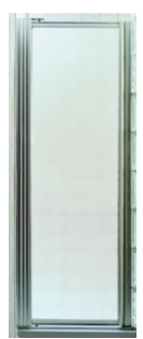
Silver with hammered glass

Each Pittsburgh Corning Glass Block Shower in the Classic or Neo Angle style is designed to accommodate a nominal 28" x 69" door. They are available with clear or hammered glass and gold or silver frames.