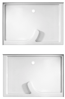
Right or Left Entry Available Size: 72"x51"

For a truly astounding shower design, step out of the ordinary and step into the beautiful Pittsburgh Corning Glass Block Walk-In Shower. A dramatic addition to any bathroom, the Walk-In Shower adds a level of elegance and luxury that today's discerning homeowner wants.