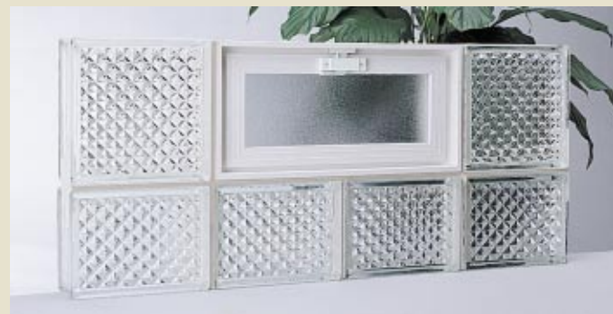
DELPHI® Pattern, with prismatic diamond design, provides moderate light transmission with maximum privacy.