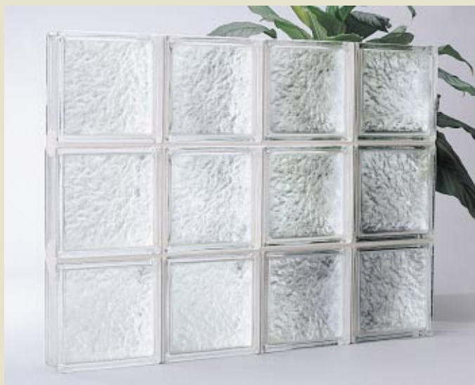
IceScapes® Non-Directional Pattern lets light in without sacrificing privacy. Maximum light transmission with a maximum degree of privacy.